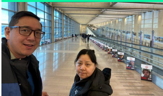
機場有許多仍被擄的以色列人質地照片 At the airport there are many photos of Israeli hostages still being held captive

耶路撒冷阿、耶路撒冷阿、你常殺害先知、又用石頭打死那奉差遣到你這裡來的人、我多次願意聚集你的兒女、好像母雞把小雞聚集在翅膀底下、只是你們不願意。(太 23:37) “Jerusalem, Jerusalem, you who kill the prophets and stone those sent to you, how often I have longed to gather your children together, as a hen gathers her chicks under her wings, and you were not willing.”